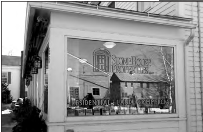
Left: Today, the Stone House Properties office is next door to Williams River Country Store.