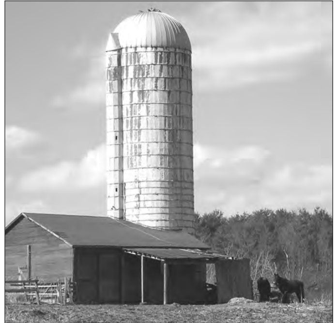
Farms remain an important part of West Stockbridge's economy and lifestyle.