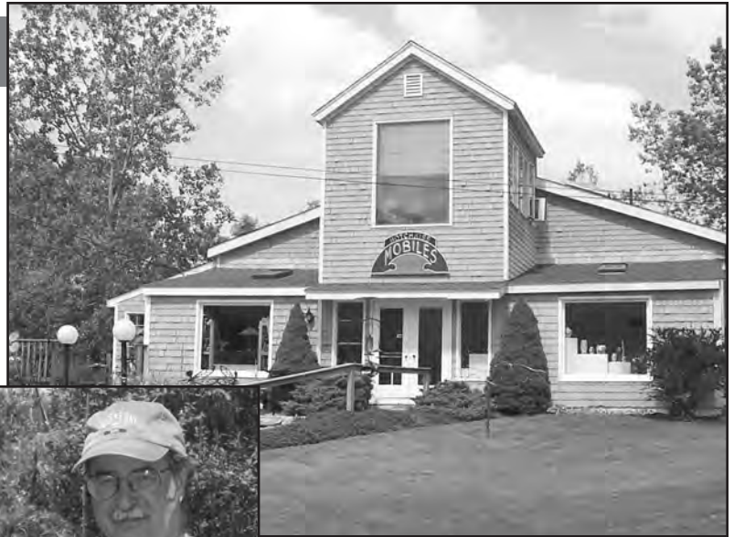
Above: The newly-renovated Hotchkiss Mobiles Gallery on Center Street.